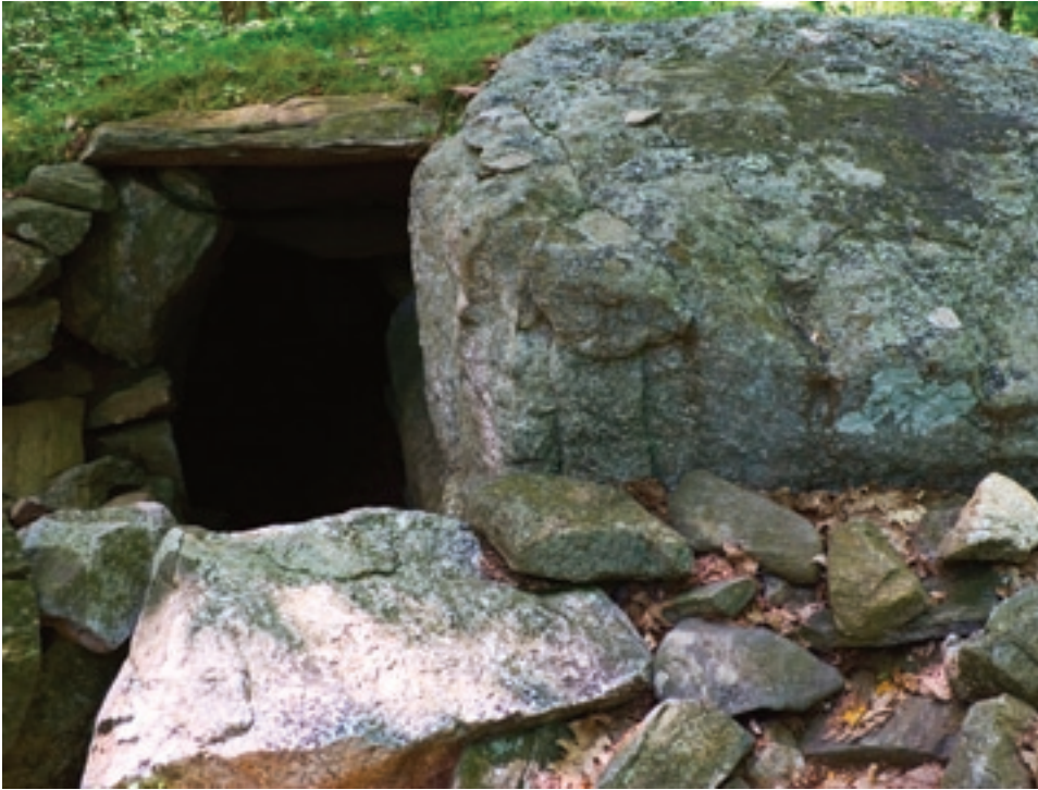
Exterior view of a Jewish rock-cut tomb

family in the gospel records, they were also the most common names in the first century. The equivalent today would be trying to find a modern cemetery that did not have anyone named Smith or Jones. Taking this evidence into account, the documentary claims that while the individual names are common, the cluster of names is not. After all, how many families in the first century could have people named Joseph, Jesus, and Mary?