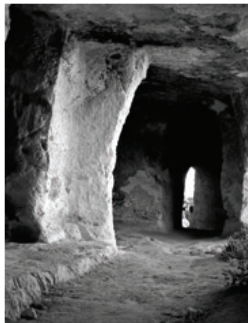
A typical Palestinian rock-cut tomb.

In Jewish tombs, there were two burials involved for a single individual. In the initial or primary burial, the body would be placed on a loculus or kokh (rectangular burial niche) for the body to decay. About a year later, the bones would be gathered together for a secondary burial, usually in a limestone ossuary (bone box). Ossuaries began to appear during the reign of Herod the Great, dateable perhaps to 20-15 B.C. (Rahmani, 1994, p. 21). Their use continued at least until the Roman destruction of Jerusalem in A.D. 70, but may have extended through the early second century.